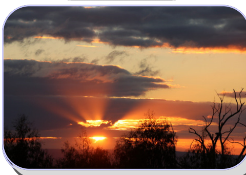
Probably more comfortable at Mt Despair by the fire A very nice sunset at the end of the day