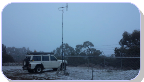
Very cold at Mt St Leonard in the early morning light. -4° at the bottom of the mast!