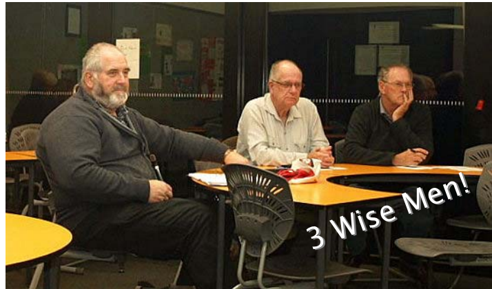
3 Wise Men!