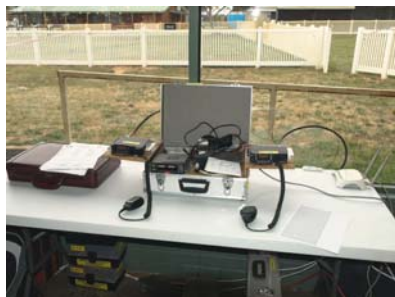
Above & left Comfort and Room with a View! Omega setup at head quarters for last year's Begonia rally at Avoca Turf Club.