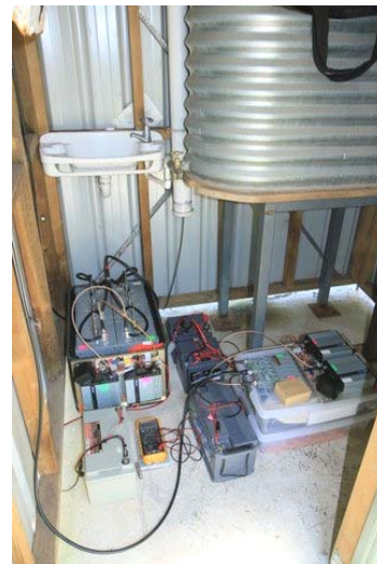
Right. Water tank in your radio room? Not ideal but sometimes you have to work with what you've got!